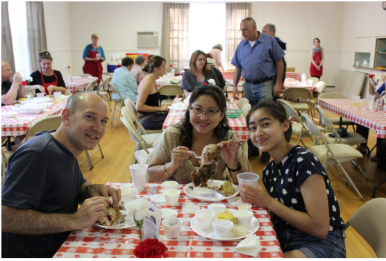
The Lipton Family enjoying their meals