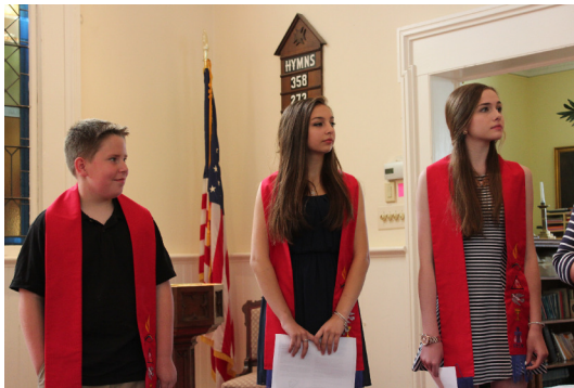
Congratulations 2015 Confirmands!