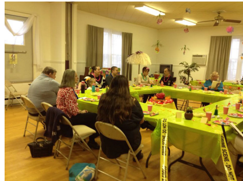
Note - the roasting pig in the center