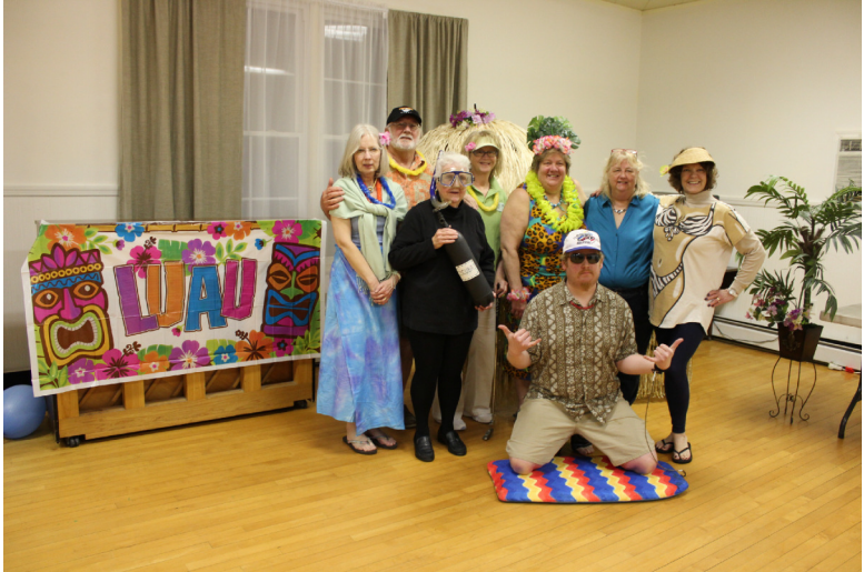
Cast of characters